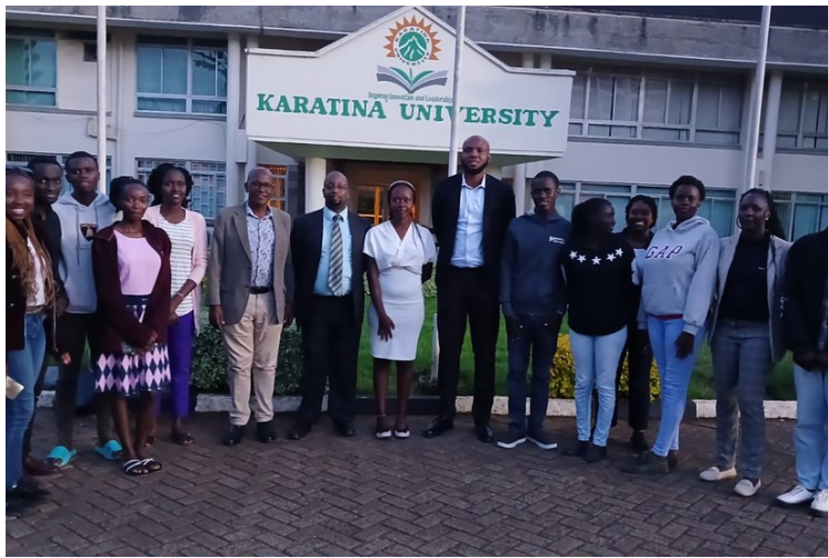
The visiting team poses for a group photo after the meeting with the members of the Presidential Awards Club at Karatina University.

The visit of the Presidential Awards team to Karatina University was a resounding success, providing students with a unique opportunity to learn from accomplished leaders and role models. The interaction with the mentors has not only inspired students to strive for excellence but has also strengthened the bonds between the university and the broader community of leaders committed to making a positive difference in the world.