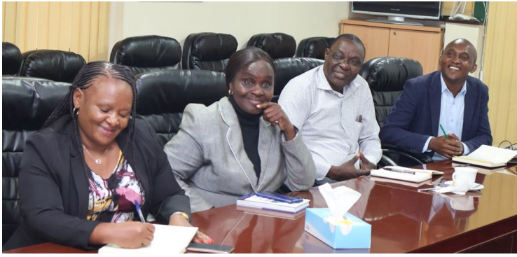
The team for Karatina University keenly following the meeting proceedings

TBK officials expressed appreciation for Karatina University's commitment to strengthening the partnership and acknowledged the existing memorandum of understanding (MOU) between the two institutions. They emphasized the importance of revisiting the MOU to enhance collaboration for the benefit of stakeholders in the tea sector. TBK reiterated its readiness and willingness to work closely with Karatina University to drive positive change and innovation in the industry