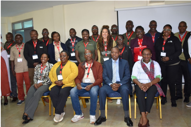
The Deputy Vice Chancellors and the Dean SNRES pose for a group with the partners of the event.

In addition to networking and career exploration, the Conservation Career Symposium provided a platform for participants to gain practical skills and insights through hands-on workshops and training sessions. Topics covered included CV and Cover