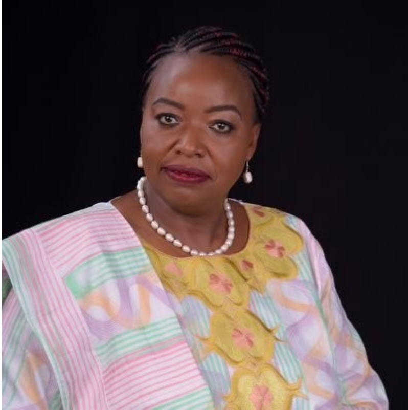
Ambassador (Dr.) Monica Juma

The Chief Guest, Amb. (Dr) Monicah Juma, the National Security Advisor to the President of the Republic of Kenya spoke on 'Leveraging Innovation and Technology for the Protection and Empowerment of Women.' She echoed that the Day proffers strategies on how to enhance gender equality in general and women empowerment in particular.