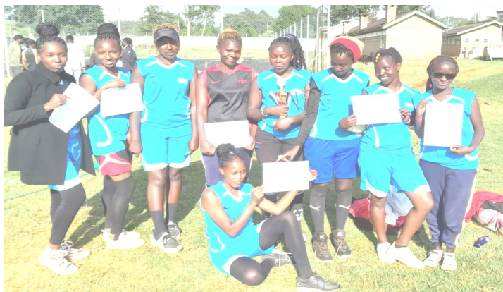
Volleyball (Women) team

KARU successfully hosted the KUSA Central 6B events. The results were as follows;