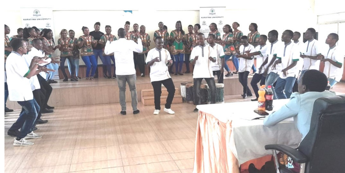
Karatina University choir presenting

Karatina University shone in the regional music festivals held on Saturday, 18 th and Sunday, 19 th February 2023 at the institution. The University Choir presented twelve (12) items, the Poetry team nine (9) items while the Dance