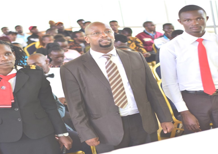
From the left, KRA facilitator, Director, Career Services and University-Industry Linkage and a