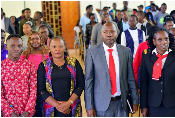
From the left: Tax Club Chairperson, Patron, KRA Nyeri Regional Manager and one of the facilitators